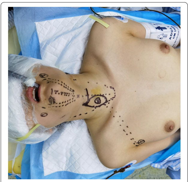
Fig. 2 The patient's position and auxiliary marker on the body surface. After general anesthesia, a supine position with neck extended was adopted, the eyes were covered with gauze and waterproof drape. The location of four trocars and corresponding pathway were marked on the body surface

Elevate the skin flap by the harmonic curved shears and gradually extend to the suprasternal notch. The midportion of the sternocleidomastoid (SCM) muscle would be the outer boundary of the skin flap. With the help of Prograsp forceps and harmonic curved shears, the midline fascia of the strap muscles, the sternohyoid and sternothyroid muscles were dissected and the thyroid gland was exposed. Then we divided the middle thyroid vein and inferior vein, and dissected the pyramidal lobe and the isthmus from the trachea successively. When handing the superior thyroid vessels, superior laryngeal nerve and the superior parathyroid gland should be protected