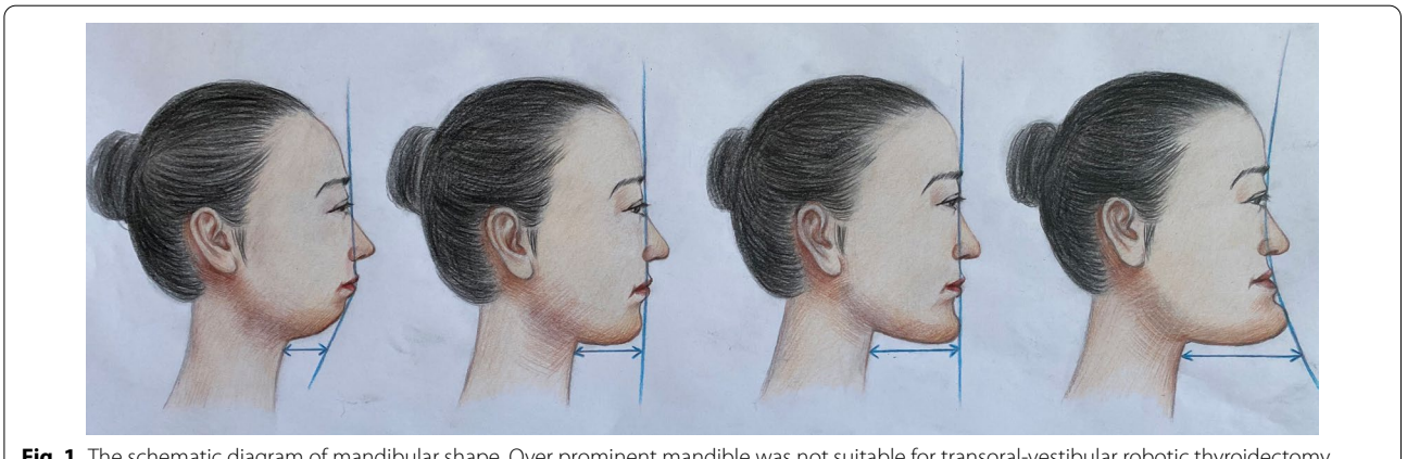
Fig. 1 The schematic diagram of mandibular shape. Over prominent mandible was not suitable for transoral-vestibular robotic thyroidectomy

Preoperative ultrasonography was used to evaluate thyroid volume outline, relationship between thyroid and adjacent organs, and lymph nodes in the central and lateral cervical regions. Vocal cord mobility should be evaluated with flexible laryngoscopy before surgery. One day before the surgical operation, patients' mouth and teeth were cleaned and treated with strong tinidazole gargle for many times; 0.1 ml of carbon nanoparticles' suspension