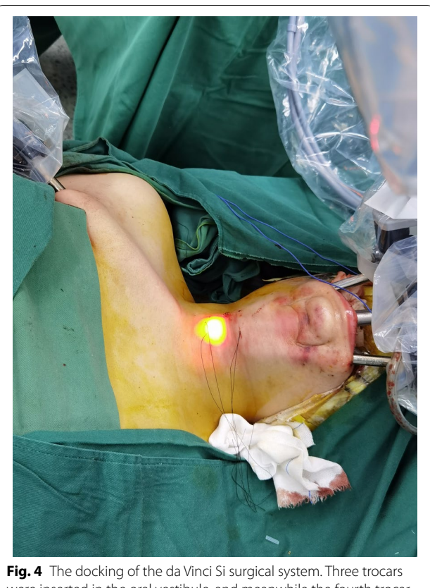
were inserted in the oral vestibule, and meanwhile the fourth trocar for was placed through the right axillary incision

much carefully by dissecting the vessels close to the thyroid gland. The superior thyroid artery can be clipped by Hem-o-lock clips if necessary. Carbon nanoparticles injection is recommended into the thyroid glands for negative parathyroid imaging in order to identify and protect the superior parathyroid gland. The parathyroid gland should be protected by fine capsule anatomy techniques during the operation. Superior pole of thyroid gland was then retracted upward and medially, therefore the white and shiny recurrent laryngeal nerve can be easily identified using an intraoperative nerve monitor (IONM) as it enters the larvnx with magnified 10\times surgical view. The thyroid gland was lifted up with the Maryland forceps through the axillary port. The soft tissue around thyroid was dissected, but tracing the distal part of the recurrent laryngeal nerve with great care to preserve it. Proper application of the harmonic scalpel can successfully remove the thyroid gland from the trachea by dissecting the Berry's ligament. An endoplastic bag was used to collect the resected specimen from the operation area. For patients with large volume of glandular lobe, an additional axillary fold incision tunnel is also a good method to facilitate specimen removal, which could reduce the risk of specimen destruction or