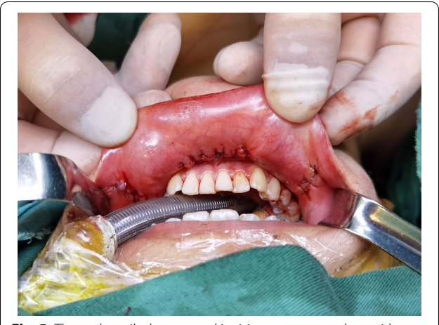
Fig. 5 The oral vestibular mucosal incisions were sewed up with absorbable sutures