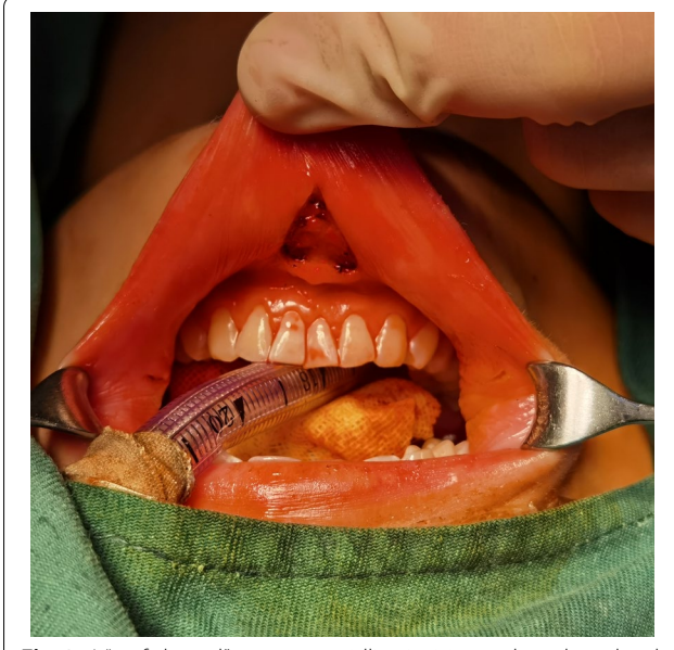
Fig. 3 A "roof-shaped" transverse midline incision and two lateral oral vestibular incisions