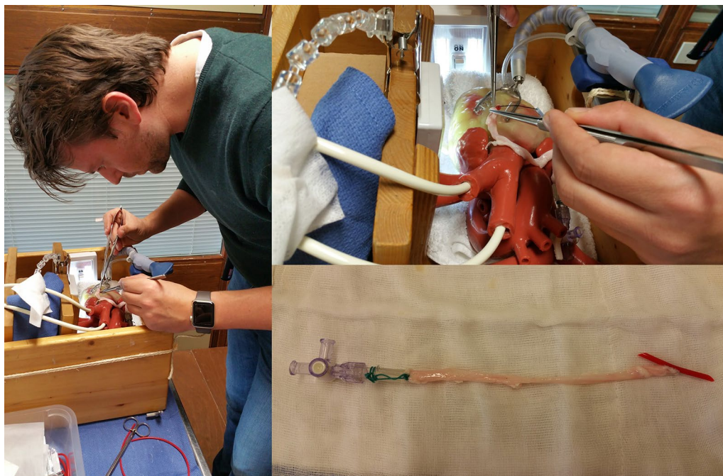
Fig. 1 (Left panel) Trainee performing an anastomosis. (Right upper panel) Anastomosis using a pig ureter and a soft plastic tube as the left internal mammary artery to the left anterior descending artery. (Right lower panel) The pig ureter graft after completion of anastomosis

We used a beating heart model (CABG HEARTS#1259; The Chamberlain group, Great Barrington, MA, USA) and installed it in a dedicated box (Fig. 1) to mimic the spatial limitations in OPCAB. Beating of the heart was created by a compressor that compressed the air and adjusted the pressure in the heart, and the frequency of