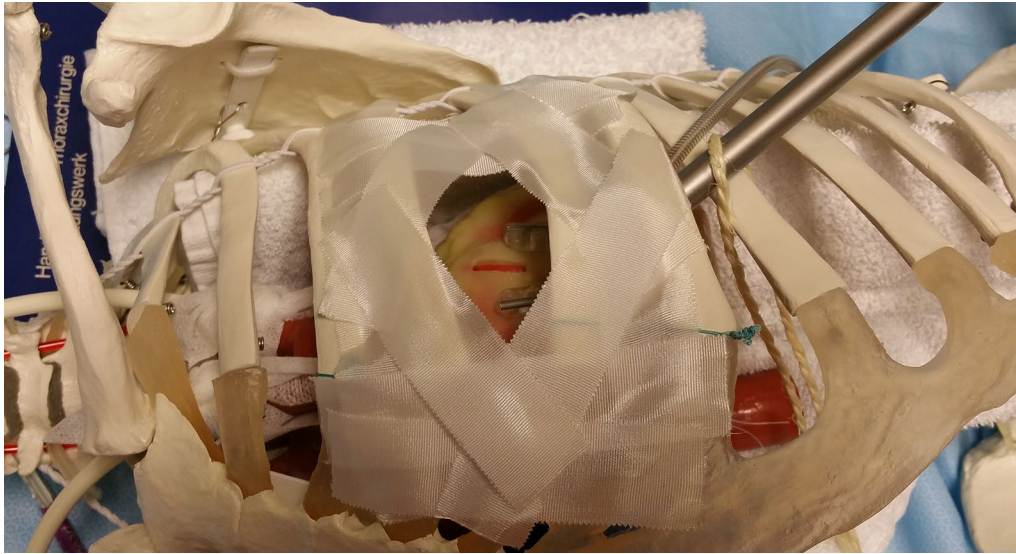
Fig. 4 MIDCAB training model using skeleton body

any increased mortality [13, 14]. From an ethical perspective, however, this remains a difficult point, especially when the exact performance level of the trainee still needs to be determined. Time efficacy also requires that trainees are maximally prepared before they start working on living subjects. In addition, MIDCAB is receiving renewed focus with the advent of robotic surgery [15, 16] and the gained interest in hybrid approaches [17, 18]. As an example, a novel option for cases of triple vessels disease is the performance of LIMA-LAD anastomosis by robotic assisted MIDCAB followed by percutaneous coronary intervention (PCI) for the other two coronary vessels [19]. Given the limited space through a thoracotomy, young surgeons who are eager to become proficient in performing MIDCAB must practice coronary anastomosis using appropriate training devices, to obtain enough experience and ease so that they can perform adequately under high pressure and ensure proper bypass quality. To this purpose, we have developed a setting to our simulation specifically for MIDCAB using a skeleton model in which the beating heart can be placed (Fig. 4). This advanced device may allow fellows to engage in more effective trainings than is available at present and to give them additional challenging training goals.