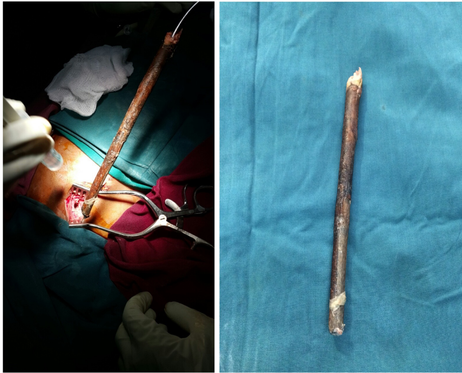
Fig. 2 Inside the operating room the wound was widened and impaling object was gently pulled out

sticks while playing outside. Similar mechanisms of injuries have been reported in abdominal impalement injuries from villages in India [18].