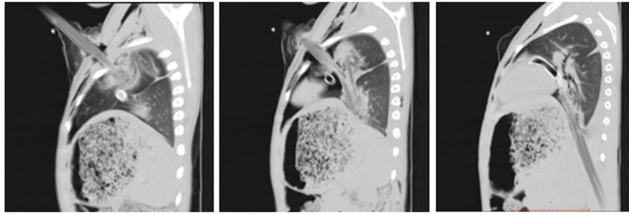
Fig. 4 Chest CT showing trajectory of the impalement in the sagittal plane, passing in close proximity to hilum of the lung and the heart. Most inferior extent seems to penetrate the diaphragm

All these safety measures rely on availability of paramedics who are called to the scene, ready and competent with all necessary equipment. From the cases we described, it can be inferred how poor the health care system is. There is no medical personnel or ambulance to come to the scene of the trauma. Meanwhile the villagers even had repeated attempts at removing the objects by themselves before they finally brought the child to a health center. Positioning during transport was not as such difficult because the impalement wasn't through and through in both cases. However, referral to our center was delayed 24 h because of the distance needed to travel.