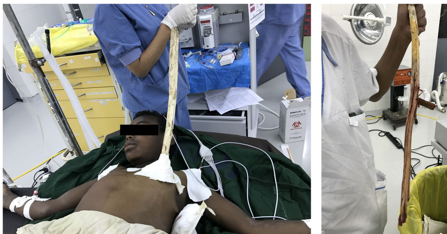
Fig. 3 The child presented with a huge length of the impaling object on the left anterior chest. The stick was stabilized by a bulky dressing around the entry site. Image taken after removal also shows the significant remaining length that was inside the body

reducing it to a manageable size for transportation [4, 11, 13]. The traumatic agent can also be mobile against the injured person. It has to be stabilized to avoid aggravating the injury. The commonly used method in the field is applying bulky dressings around the exposed part of the object [3, 5]. Patients have to be transported quickly but a large impalement may create difficulties [8]. Sometimes the usual supine position will be impossible and lateral positions would be appropriate [5].