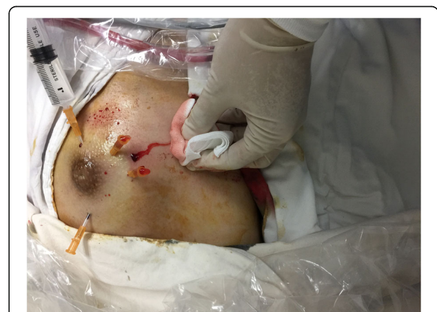
Fig. 2 Irrigation of lesions. Normal saline was injected into the lesion through the indwelling hoses. Please note that liquid is flowing out of the other indwelling hoses and surgical inlets, indicating that the indwelling hoses are unobstructed

Prior to every irrigation, normal saline was injected into the indwelling hoses to confirm the hose patency, and then the lesion was washed with iodophor, metronidazole, and dexamethasone. During the first week after surgery, dressing changes and irrigations were performed daily and then the frequency was gradually reduced according to the patient's recovery. When the inflammation of the patient's lesion subsided and no new pus was being produced, the irrigation fluid became clear, and the mass gradually softened and disappeared, at which point the indwelling hose can be gradually removed. All indwelling hoses were removed from 2 weeks to 1 month after surgery.