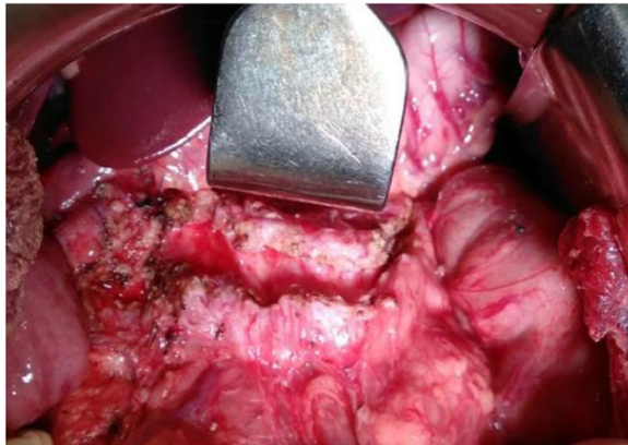
Fig. 1 Frey's picture- Opening of Main pancreatic duct (tail to head) with coring in head region

out malignancy. After this jejunum is dissected 20 cm distal to Treiz ligament and opened up longitudinally along the antimesenteric side, and longitudinal side-side pancreatojejunostomy (Fig. 2) is performed by nonabsorbable monofilament suture, followed by end-side jejunojejunostomy. Careful hemostasis is very important in the Frey's procedure following which a single abdominal drain is kept. It is advised that to prevent recurrence, complete decompression of the pancreatic ducts in the head of the pancreas and full-length drainage of the MPD from the head to the tail is the most important part of the surgery.