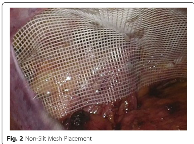
Fig. 2 Non-Slit Mesh Placement

A 10 × 15 cm polyester mesh was placed directly over the cord structures (Group NS) (Fig. 2), or “key-holed”, after engraving vertically the mesh in the upper part, to accommodate the cord (Group S) (Fig. 3). The mesh was securely fixed with 2 ml of fibrine glue (Tisseel/Tissucol,