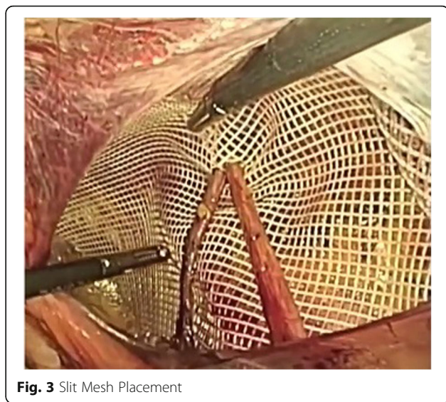
Fig. 3 Slit Mesh Placement

Baxter Healthcare, Deerfield, IL, USA) in order to avoid vessel injury or nerve entrapment, in accordance with IEHS guidelines [4]. The peritoneum was closed with a running suture in V-Loc 3/0, and trocars were removed under direct visualization. The fascial defect of 10 mm port was then closed under direct visualization.