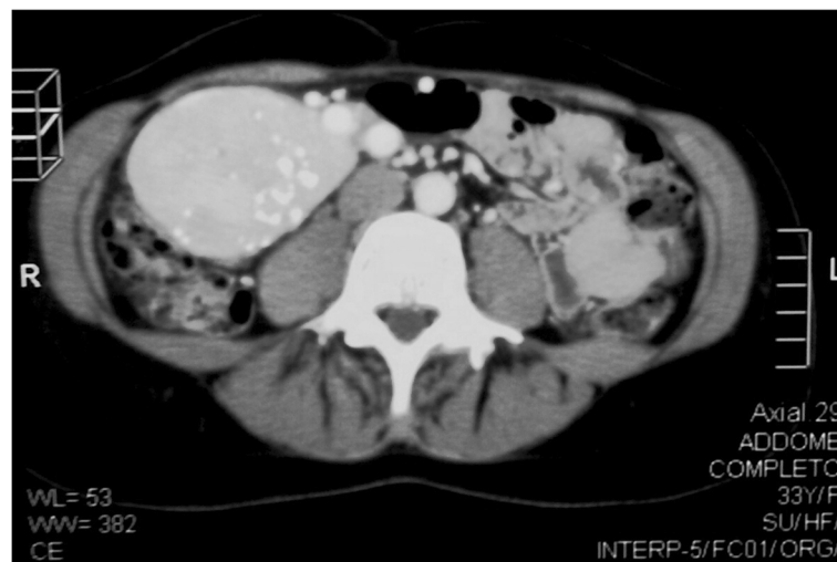
Fig. 3 CT scan showing a solid inhomogeneous mass, with inner calcifications

The pathophysiological basis of Castleman’s disease is still unclear. However, chronic low-grade inflammation, immunodeficiency status and dysregulation autoimmunity have been proposed as likely pathogenic mechanisms. The critical role of inflammatory mediators such as interleukin 6 (IL-6) or interleukin 10 (IL-10) and human herpes virus 8 (only in Multicentric variant) has been well demonstrated in preclinical animal models [14].