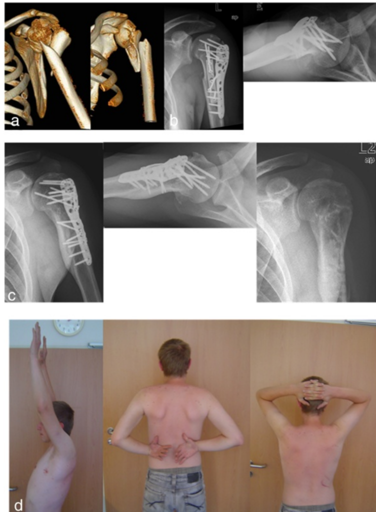
Fig. 3 a 24 year old male with dislocated proximal fracture with metaphyseal comminution and intermuscular fragment. b postoperative x-ray showing anatomical reduction after double plate osteosynthesis. c X-ray after one year showing complete healing of the fracture, x-ray after material removal. d functional result after 2 years, Constant 90 points

radiographs demonstrated complete fracture healing in six patients and one incomplete avascular necrosis. None of the patients sustained loss of reduction. Three patients were reoperated: Two elective material removal after one year (Fig. 3) and one removal of perforating screws after 9 months and complete material removal with arthrolysis of the shoulder joint after 21 months. The medium, not adapted, Constant score is 80 Points (58–94). The medium Constant score of the non-affected side was 91 Points (84–96). Functional results revealed a mean range of motion (flexion/extension/adduction/abduction/internal rotation, external rotation) of 150 (110–170)/40 (30–50)/40 (30–50)/140 (90–180)/60 (50–90) and 80 (40–90)°. Patients subjective satisfaction was graded mean 3 (range: 0–6) in the visual analog scoring system (VAS).