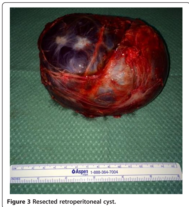
Figure 3 Resected retroperitoneal cyst.

sequelae of a mesenteric or omental haematoma or an abscess which was not resorbed [5,6].