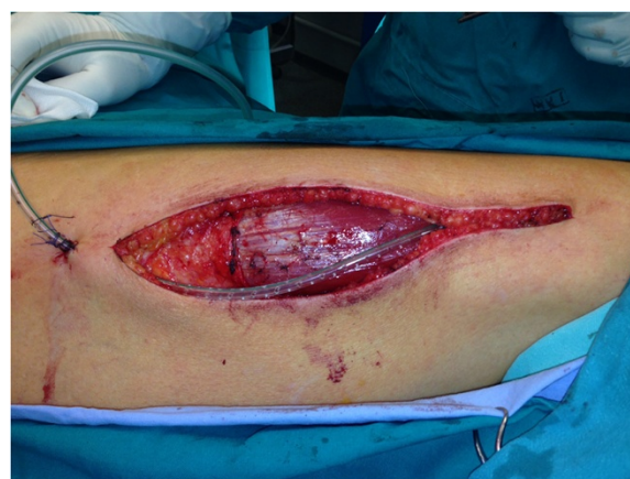
Figure 1 Harvesting region.

Primary retroesophageal suture of the pillars was performed. For severely disrupted hiatus a complex reconstruction is required. In such a case the left crus is plicated to normalize the crural length, permitting a standard hiatal reconstruction [14]. Afterwards, an autologous fascia lata graft was placed in on-lay fashion and fixed with biodegradable tacks (Figure 2). There is an issue regarding fascia lata fixation. Solid and slippery surface of the graft, compared to mesh structure, may cause difficulties. However, a proper dissection of the retro-esophageal space allows enough room for the fascia lata deployment. After a proper positioning of the graft, the initial fixation is crucial. First tacks are placed on the most proximal part of the graft allowing the