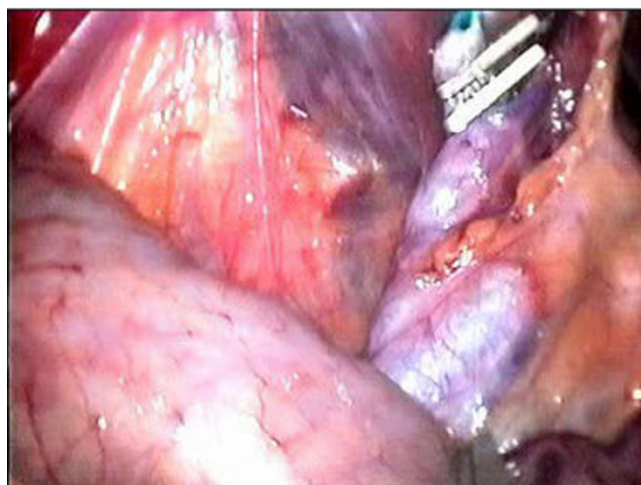
Figure 2 The visualisation of cystic duct and ductus choledochus with methylene blue after removal of gall bladder.

Bile duct injuries are associated with significant morbidity, prolonged hospitalization, increased financial burden, potential litigation and occasional mortality [1,5,6,10,11]. It is the third most commonly litigated general surgical complication in The United States and it has been also reported that on the average two procedures (between 1 to 8) are required for definitive repair of bile ducts [5]. Obviously, if bile duct injury is noticed preoperatively and repaired in the best way, morbidity and mortality rates would be significantly reduced.