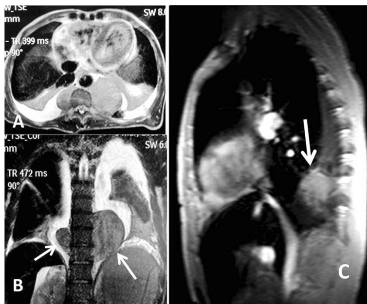
Figure 2 MRI features of the case. A: MRI scans reveals two masses in the posterior mediastinum. B: MPR on coronal plane shows a bilateral thoracic paravertebral mass. C: MPR on sagittal plane confirms the left mass in the posterior mediastinum.

of the patients are asymptomatic [7,8,10-12,18,21,22]. But some patients with mediastinum myelolipoma presented with productive cough [9], the stiff neck [13], dull back pain and a cough [14] or central chest pain [15]. The patients with pulmonary myelolipoma complain of fever [16], productive cough [17,20] or intractable lumbago [19] and the others were asymptomatic (Table 1). There was no pain or cough in our case caused by the lesion, but it was detected from the chest radiography during a routine health check.