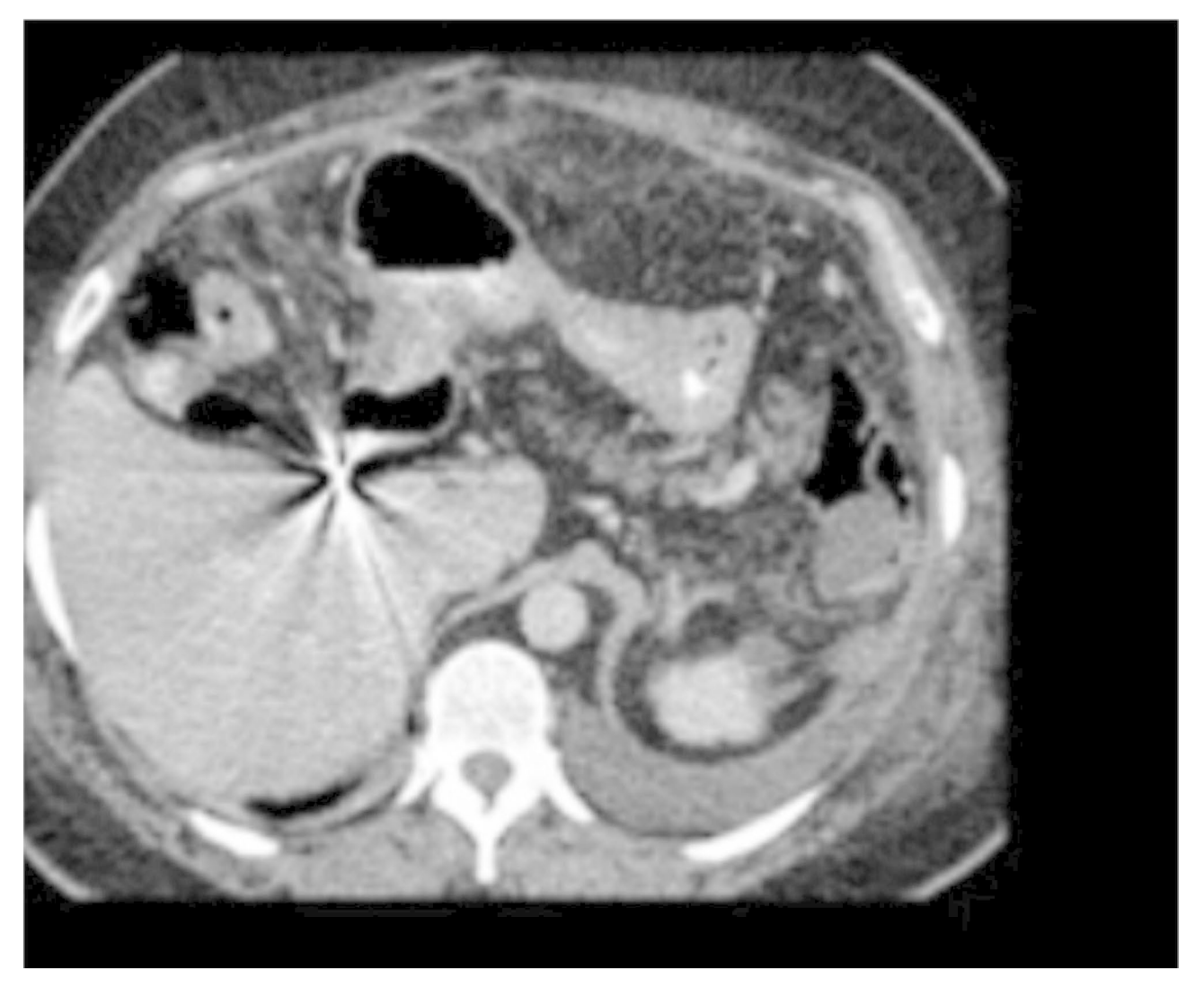
Fig. 2 CT contrast post splenectomy after truma

The blood sample was collected in EDTA containers and was ready in 2 h. All samples were examined by