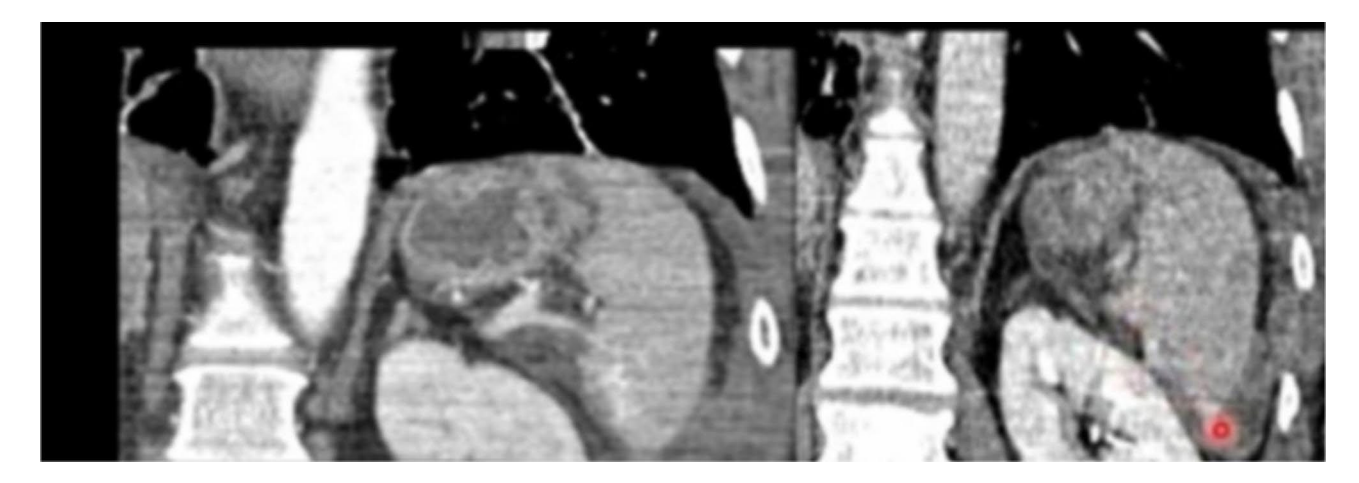
Fig. 3 CT contrast showing grade 5 tear after falling from up

a NAVIOS F.cytometer (Beckman colter), and for each examination, 100,000 occurrences were done.