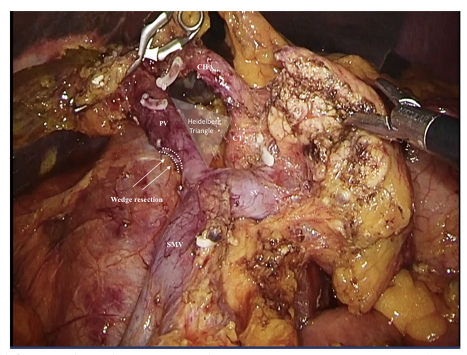
Fig. 2 Surgical field of SILPD + 1 with PV wedge resection. PV, portal vein; SMV, superior mesenteric vein; CHA, common hepatic artery; SV, splenic vein; CT, coeliac trunk

diagnosis included five cases of pancreatic ductal adenocarcinoma and one case each of duodenal papilla tumor, pancreatic neuroendocrine tumor, serous cystadenoma, pancreatic neuroendocrine tumor, and chronic pancreatitis. Two (20%) patients had portal-vein involvement with wedge resection. The median operative time was 222.5 (range 194.0–300.0) min. The median blood loss was 75.0 (range=50–250) mL. One (10%) patient developed a pancreatic fistula (grade B). One (10%) patient had a major postoperative complication (Clavien– Dindo \geq grade 3) requiring reoperation in laparoscope as afferent loop obstruction. However, no patient suffered postoperative bleeding, biliary leakage, and grade C pancreatic fistula. No 90-day mortality was found.