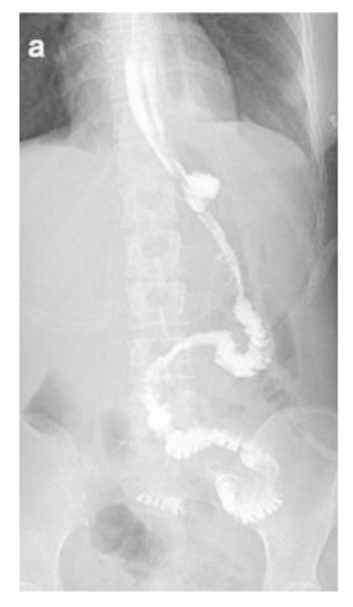
Fig. 3 Upper gastrointestinal angiography using iohexol on day 3 after SPLT-TLTG. The anastomotic stoma was unobstructed, with no contrast agent overflow and no anastomotic stenosis, and the distal jejunum was unobstructed

All steps prior to reconstruction in LATG were the same as those used in SPLT-TLTG. Following the D2 LN dissection, the duodenum was cut off from the duodenal bulb, and the pneumoperitoneum was released. A 7–8cm incision protected by an incision protector was made in the exact center of the epigastrium. The stomach was then pulled out, the lower end of the esophagus was secured with purse-string forceps, and the stomach was cut off with a linear cutting stapler and removed alongside the previously dissected tissue. After completing the purse-string suture, the purse-string forceps were