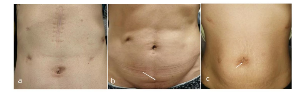
Fig. 4 Abdominal photograph 6 months after surgery. (a) Abdominal photograph 6 months after LATG; (b) Abdominal photograph 6 months after SPLT-TLTG, the surgical specimen was taken out through the lower abdominal transverse incision (indicated by the arrow); (c) Abdominal photograph 6 months after SPLT-TLTG, the surgical specimen was taken out through the extended trocar hole below the umbilicus (indicated by the arrow) Abbreviations: LATG, laparoscopy-assisted total gastrectomy; SPLT, self-pulling and later transected; TLTG, totally laparoscopic total gastrectomy

The conventional laparoscopic-assisted E-J is primarily completed with purse-string forceps and circular staplers. Therefore, the initial TLTG also focused on the circular anastomosis, of which the most commonly used is the Orvil<sup>™</sup> method [11, 12] and reverse puncture method [13, 14], both of which require the insertion of the anvil, which is difficult to complete. Compared with circular anastomosis, linear anastomosis has many advantages, including fewer requirements on the diameter of the digestive tract, a lower probability of anastomotic stenosis, and the stapler can be placed through the 12 mm trocar hole, which is widely used in TLTG [5-8]. In TLTG, the main methods using linear staplers are the FEEA method [15] and the overlap method [16]. Compared with reversed peristalsis anastomosis in FEEA, the overlap is a straight-forward anastomosis, which can