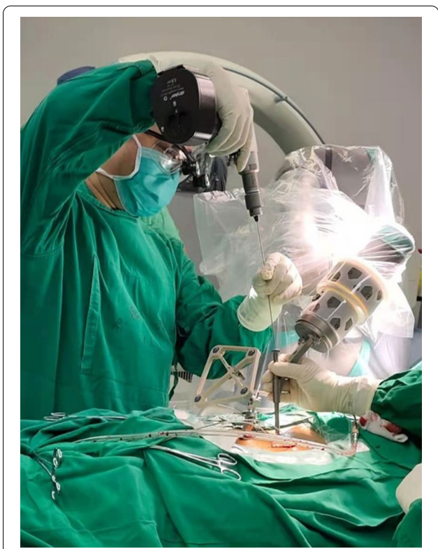
Fig. 2 Robot-assisted pedicle screw placement

C—pedicle cortical violation < 4 mm; grade D—pedicle cortical violation < 6 mm; grade E—pedicle cortical violation > 6 mm. Grade A screw position is considered perfect, and grades A and B screw positions are considered clinically acceptable.