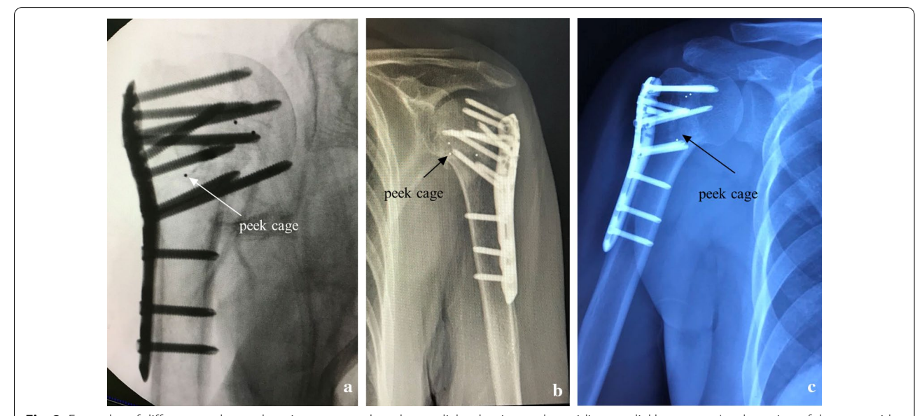
Fig. 2 Examples of different peek cage locations to complete the medial reduction and providing medial buttress. a Implantation of the cage with a tilt angle to the humeral head. b Peek cage with a more horizontal and lower position. c Peek cage with vertical position to the proximal fragment

Patients were assessed using the Constant-Murley score (CMS), disability of the arm, shoulder and hand (DASH)