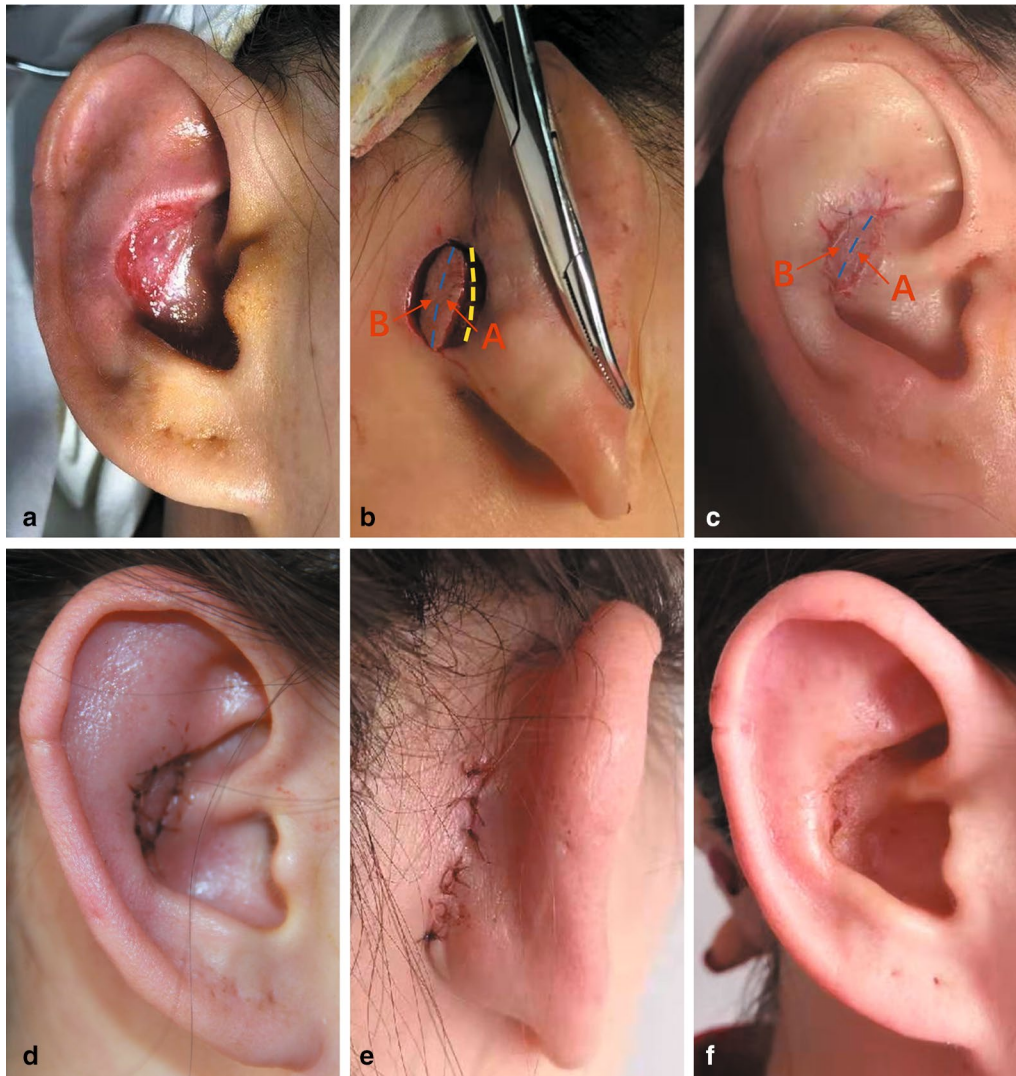
Fig. 1 A 24-year-old female presented with an anterior conchal skin and cartilage defect after rhinoplasty with a conchal cartilage graft. A revolving-door (RD) flap was performed to cover the anterior conchal defect as a single-stage procedure. a Preoperative view of the anterior conchal skin and cartilage defect. b Intraoperative view: the flap, which was divided into retroauricular (A, red arrow) and mastoid (B, red arrow) parts by the cephalon-auricular sulcus (dashed blue lines), was dissected around the periphery and elevated along a deep plane. Its base was left unattached at the cephalon-auricular sulcus to maintain the completeness of the vascular pedicle (beneath dashed blue lines), which contained tributaries of the posterior auricular artery (PAA). A through-and-through opening space was ready to be created for transposition of the flap, as shown by the dashed yellow lines. c Parts A and B of the flap were rotated approximately 180° and 30° on its vertical axis, respectively, and pulled through the defect from the distal edge to cover the anterior conchal defect. Part A (red arrow) of the flap settled at the medial half of the conchal defect, and part B (red arrow) covered the lateral half of the defect. d Oblique view of the concha one day postsurgery. The flap survived completely, without total or partial failure. e Posterior view, one day postsurgery. The donor site was closed with interrupted mattress sutures. f Results 6 months after the surgery. There were no obvious scars or retraction at the recipient site

(RD) flap was performed to cover the anterior concha defect as a single-stage procedure.