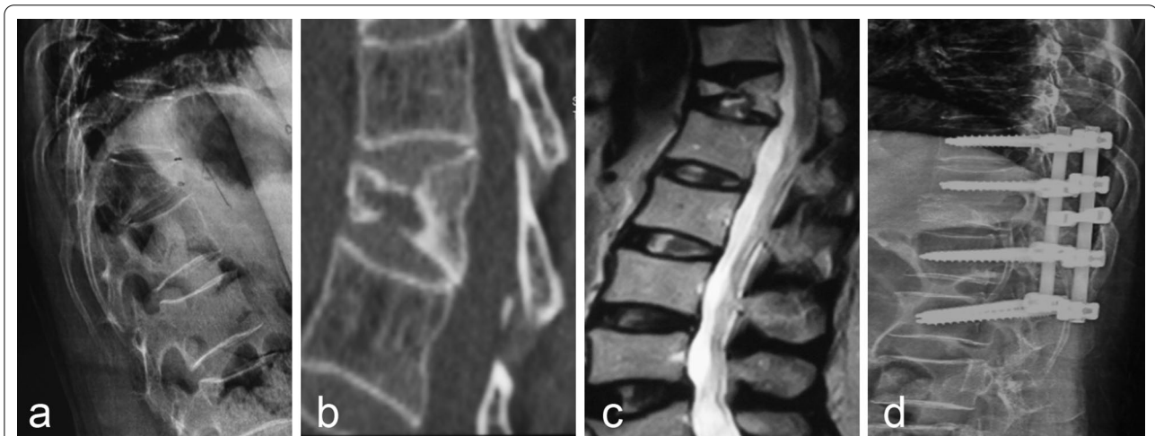
Fig. 4 A 63-year-old female patient (Grade IV) presented with minor trauma 10 months ago and low back pain 2 months ago, which was associated with activity. a Thoracic X-ray showed a height loss of the T12 vertebral body and kyphosis of the thoracolumbar segment; c MRI T2 image showed low signal in the T12 vertebra; d Postoperative X-ray showed that the patient underwent posterior osteotomy and fusion internal fixation

with posterior decompression and reduction fusion and internal fixation. After revision surgery, the patient’s discomfort symptoms were relieved.