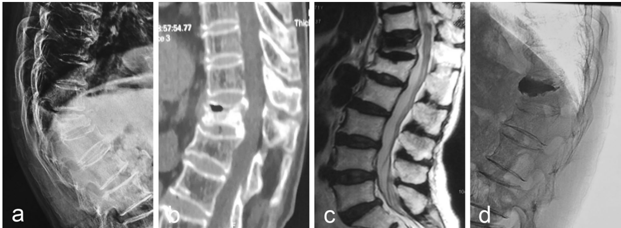
Fig. 1 A 71-year-old female patient (Grade I) presented with minor trauma 5 months ago and low back pain 2 months ago, which was associated with activity. a The X-ray showed wedge-shaped changes of the T12 vertebra with kyphosis of the spine; b CT showed anterior collapse of the T12 vertebra with low-density shadow and peripheral sclerosis; c MRI T2 showed low signal in the vertebral body; d Postoperative X-ray showed that the height of the injured vertebra recovered well and the kyphosis deformity was corrected