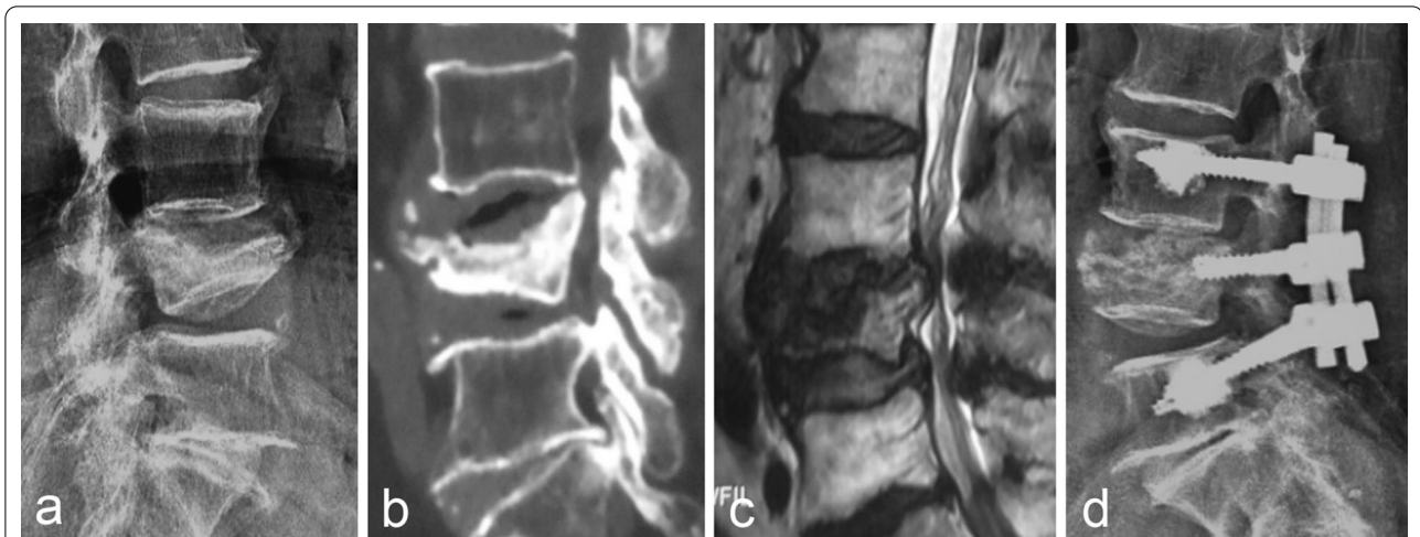
Fig. 3 A 73-year-old female patient (Grade III) presented with mild back pain due to trauma 4 months ago, and presented with increased pain and numbness and weakness in both lower limbs 1 month ago, accompanied by intermittent claudication. a Lumbar spine X-ray showed the height of the L4 vertebra was lost and the endplate collapsed; b Sagittal CT showed collapse of the L4 vertebral body, low-density shadow in the vertebral space, protrusion of fracture block into the spinal canal, and spinal stenosis at the same level; c MRI T2 showed abnormally low signal in the L4 vertebra, with obvious dural compression and spinal stenosis at the same level; d Postoperative X-ray showed that the patient underwent posterior decompression and bone graft fusion with cement-reinforced internal fixation