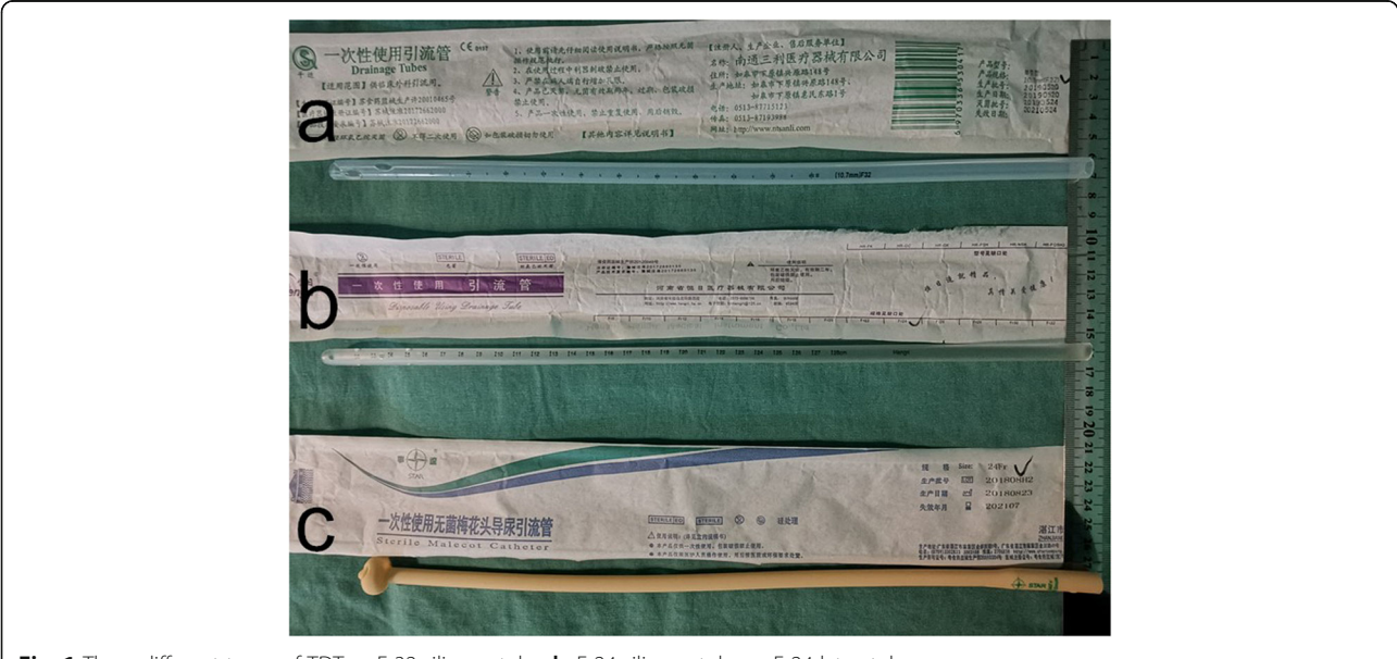
Fig. 1 Three different types of TDT, a: Fr32 silicone tube, b: Fr24 silicone tube, c: Fr24 latex tube

The occurrence of AL should be considered as follows [14, 15, 1] persistent fever with unknown infection signs