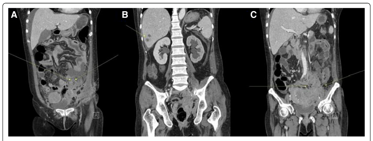
Fig. 1 CT finding at the emergency room. a CT scan of the abdomen-pelvis revealed a microperforation ( arrow ) of the sigmoid colon and abscess in the left lower quadrant. b CT scan showed a hepatic lesion ( arrow ) and bilateral hydronephrosis. c There was a large infiltrating heterogenous hyperattenuating conglomerated mass invading the urinary bladder, left adnexa, sigmoid, left inguinal canal and left pelvic wall area ( arrow )

Since the patient showed minimal peritoneal irritation and stable vital signs, and extensive organ resection was expected due to invasion of bladder and ureters, treatment was initially conservative rather than primary debulking surgery. The antibiotic regimen was always