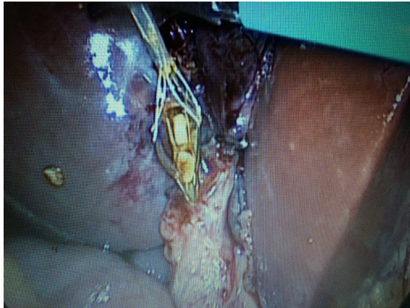
Fig. 2 Trans-cystic stone extraction by Dormia basket

identical to the trans-cystic approach. Through the choledochoscope, flushing with saline was done under pressure to facilitate clearance of small stones. Dormia basket and/or balloon catheter can be also used to pull stones to the abdominal cavity then to be retrieved outside (Fig. 4). The choledochotomy was closed over a T-tube in nine cases and over an antegrade stent in 10 cases; the stent was inserted through the site of chole-dotomy under guidance of fluoroscopy for removal by ERCP later. Primary closure of the CBD was done in the remaining seven patients with absorbable suture. External tube drains were used only when we perform choledochotomy technique and not used in trans-cystic technique.