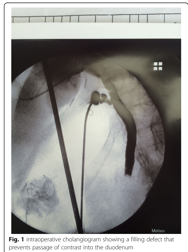
Fig. 1 Intraoperative cholangiogram showing a filling defect that prevents passage of contrast into the duodenum

This approach was used either after failed trial of cannulation of cystic duct or failed stone extraction through cystic duct, in three patients, we employed it without trying the trans-cystic technique because they were post failed ERCP due to big impacted stones. IOC was done through CBD puncture with lumbar needle which showed CBD stones. In these cases we converted to choledochotomy in which the CBD was exposed and a vertical ductotomy was done on the anterior surface of the duct below the junction between cystic duct and CBD (Fig. 3). The techniques for stone clearance are