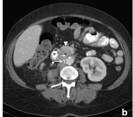
Fig. 1 Abdominal CT scan at admission. Axial slices of a contrast enhanced computed tomography showing a 29 x 41 mm abscess (thick white arrow) in the right psoas muscle (a). Positive oral contrast media marking the fistula (small white arrow) from the thickened wall of the duodenum (white arrowhead) to the abscess (b)