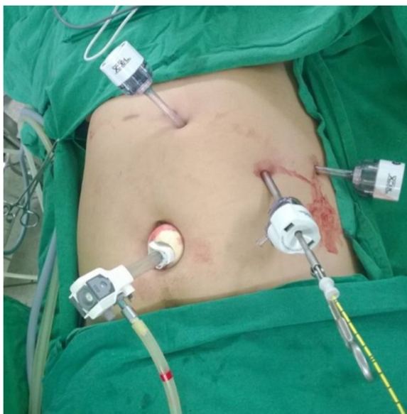
Figure 1 Port positions. 1, Camera port. 2, Epigastric port. 3, Left midclavicular port. 4, Lateral port.

The gallbladder was distended and surrounded by adhesions. The first assistant grasped the fundus of the gallbladder and pulled it upward and laterally via the left lateral port. The right-handed surgeon grasped Hartmann’s pouch and pulled it laterally using his left hand via the epigastric port and dissected the adhesion using his right hand via the left midclavicular port. Identification of Calot’s triangle was difficult because the anatomy could not be clearly identified as a result of the previous inflammation (Figure 2). Therefore, intraoperative cholangiography was performed, and no abnormal variations were demonstrated (Figure 3). After the cystic duct and artery had been individually clipped and divided safely, the gallbladder was separated from its bed by