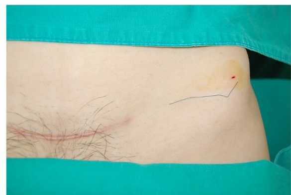
Figure 3 The foreign body removed through a 2-mm skin incision. The nylon suture material was confirmed, without the knot portion.

More cases and studies are needed to explain the mechanism of the transverse migration of long suture materials. The results of these studies may provide