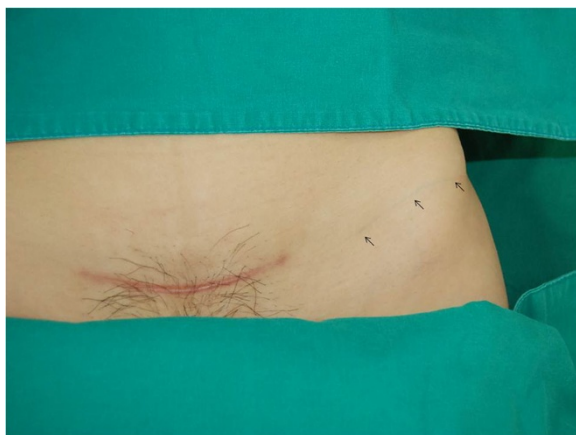
Figure 1 The 10-cm thread-like object in the left lower quadrant of the abdomen (arrows).

Small remnants of nonabsorbable suture materials in the dermis or hypodermis (subcutaneous tissue) are known to migrate toward the superficial layer or occasionally to other sites within the human tissue. The phenomenon can be associated with complications, as reported in plastic surgeries such as blepharoptosis repair [3]. The mechanism of the migration was often thought to be related to foreign body immune reaction or to the force generated in wound contracture. However, no clear explanation has been proposed. To our knowledge, migration of relatively long suture materials, as in the present case, has not been reported yet. We retrieved related literature via PubMed by using keywords “migration”, “movement”, and “suture material”. In our case, the 10-cm length of the nylon suture migrated transversely to a relatively long distance (approximately 15 cm) within the dermis layer, without remarkable tangling of the entire length of the suture.