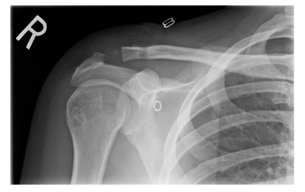
Figure 1 ST allograft reconstruction of the AC joint with single-tunnel technique.

For the two-tunnel technique, the same delto-pectoral approach was used. Two holes were drilled in the clavicle to reconstruct each of the two CC ligaments, trapezoid and conoid ligaments. The lateral tunnel is created as in the single-tunnel technique. The medial tunnel is located 4.5 cm medial to the AC joint. A 5.5 mm tunnel is reamed like the medial tunnel. A single ST graft was prepared and looped under the coracoid. The lateral free end was brought up through the lateral tunnel, and the medial free end through the medial tunnel. The AC joint is reduced, and the grafts fixed into the tunnels with 5 mm biotenodesis screws and the graft tied to itself (Figure 3). If using tightrope augment, a guide pin is placed between the two graft tunnels, from midline, through the clavicle and base of coracoid. A 4.5 mm tunnel is reamed over the guide wire and the Tight-rope device placed through the clavicle and coracoid and secured to the inferior cortex of the