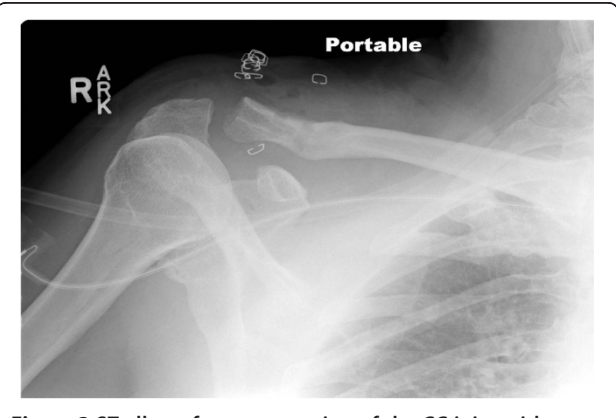
Figure 3 ST allograft reconstruction of the CC joint with two-tunnel technique.

All patients were placed in a sling immobilizer post-op for 4 to 6 weeks. Gentle pendulums and Codman's were begun post-op day 1. At 4 weeks therapy was begun with passive motion and cuff isometrics. Resistive program started at 8 weeks. Patients were generally allowed to return to manual work and athletics at 4 to 6 months depending on level of rehabilitation. Contact sports not prior to six months. All patients were evaluated clinically and radiographically using a modified UCLA rating scale [5,17], which reflects three parts: maintenance of reduction, objective evaluation of the patient's function, and complications secondary to operation. In the radiological evaluation, the roentgenographic rating was determined by the degree of displacement of the AC joint, which